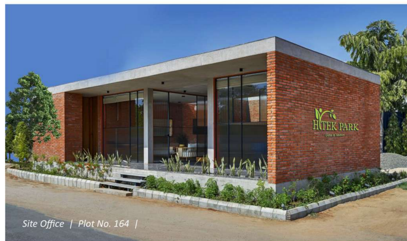
Site Office | Plot No. 164 |