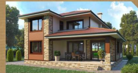
Lake View Houses