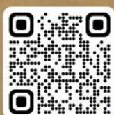
SCAN FOR SITE LOCATION